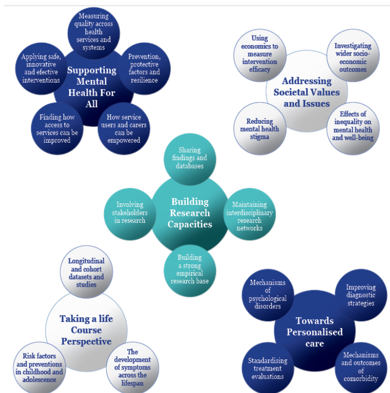
Figure 1: ROAMER research priorities

The agenda for mental health research in Europe has been already developed. In October 2011, the European Commission funded a ROADmap for Mental health Research (ROAMER). In 2015, ROAMER published a comprehensive, coordinated mental health research agenda for Europe based on systematic reviews of published work and consensus decision making involving more than a thousand stakeholders and experts: individuals with mental health problems and their families, workers in mental healthcare, service providers, governmental policy makers and funders and payers of research and services (Wykes, 2015).